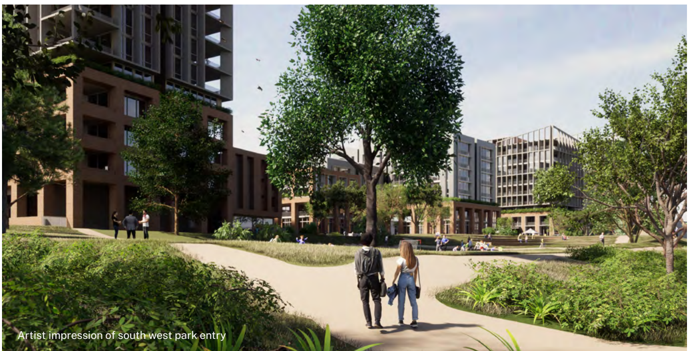
Artist impression of south west park entry

392 proforma template email submissions objecting to the proposal, (included in Attachment A).