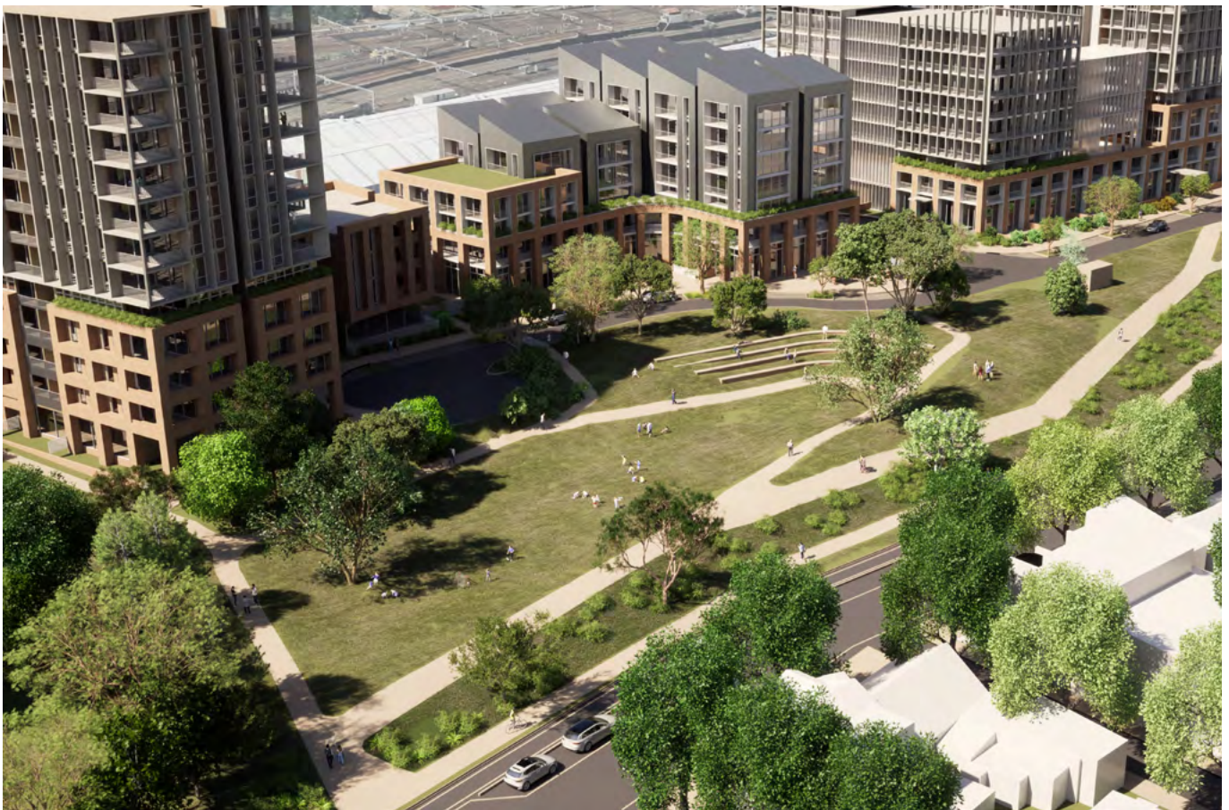
Artist impression of overall Explorer Street rezoning

NSW Land and Housing Corporation will give tenants at least 6 months notice before relocation and will have a dedicated relocations officer to provide support through the relocation process.