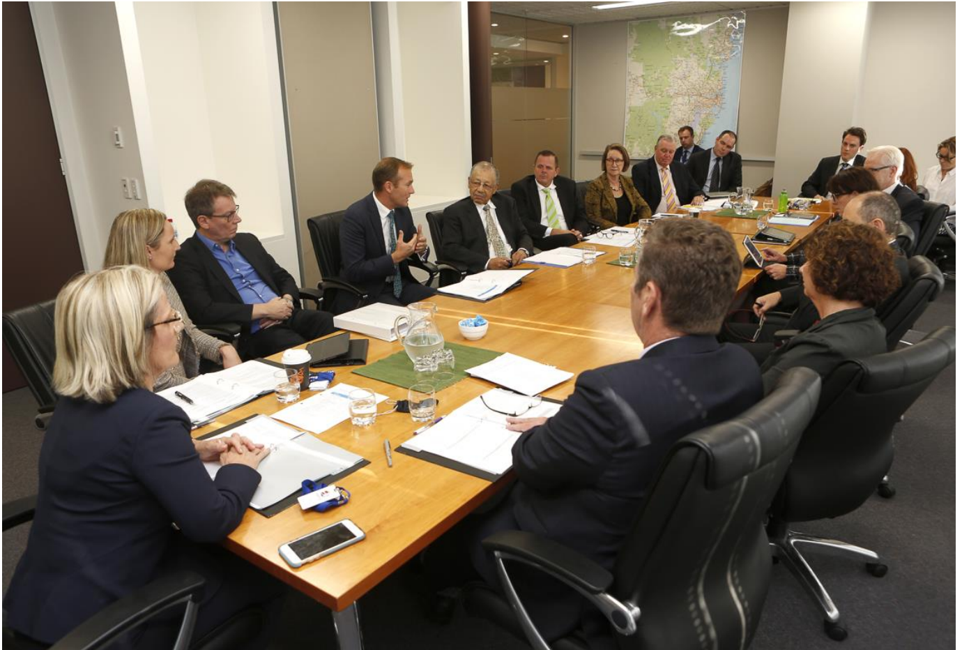
The Inaugural Greater Sydney Commission meeting held on 2 May 2016