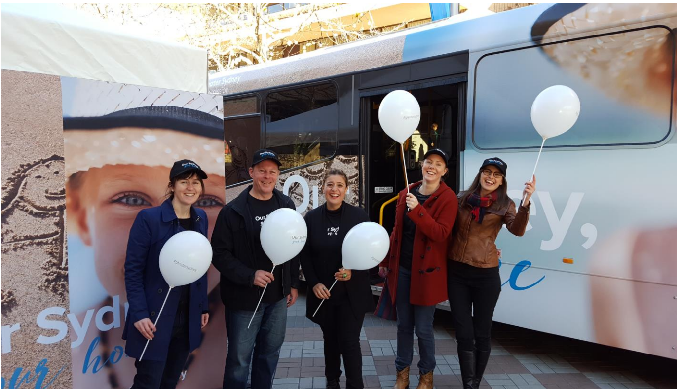
Greater Sydney Commission staff at a community engagement event in Hornsby in July 2016

The Government's decision to allocate the Commission an additional $41 million over four years signals its support for the Commission and commitment to strategic planning excellence in NSW. The Commission has a clear mandate to lead strategic conversations across the community, across all levels of government, and with as many stakeholder groups across Greater Sydney as practical. The Commission's activities are frequently published on its website and circulated via an e-newsletter so that every Sydneysider can be kept informed.