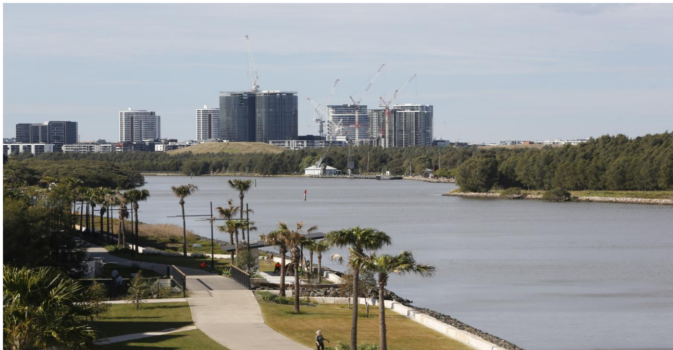
A snapshot from the Parramatta River of the Greater Parramatta and Olympic Peninsula