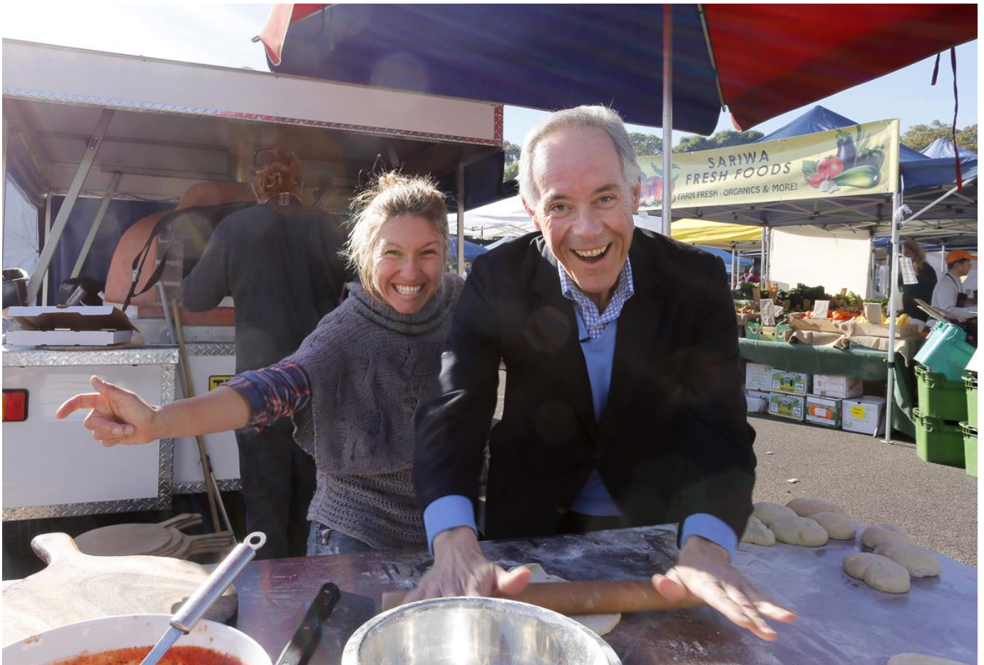
The Honourable Morris Iemma, District Commissioner – South at our first community engagement event in Canterbury in June 2016

The Our Sydney, Your Home community engagement program was launched on 20 June 2016. The program has been designed to understand community values, needs and aspirations for each District, to inform the District Plans.