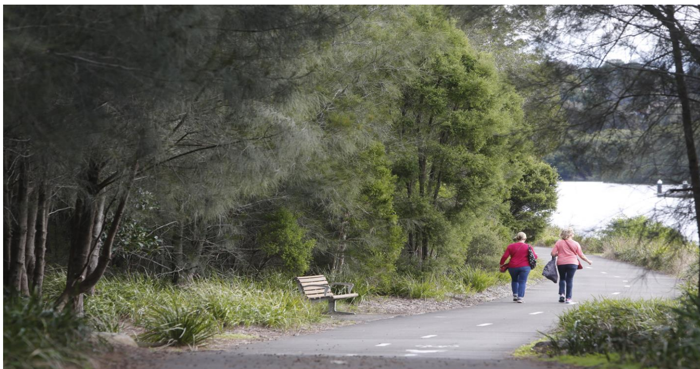
The Metropolitan Greenspace Program funds projects to improve outdoor recreational space

Looking forward, the Commission will work with stakeholders to ensure the program aligns closely with the aims and objectives established by the District Plans.