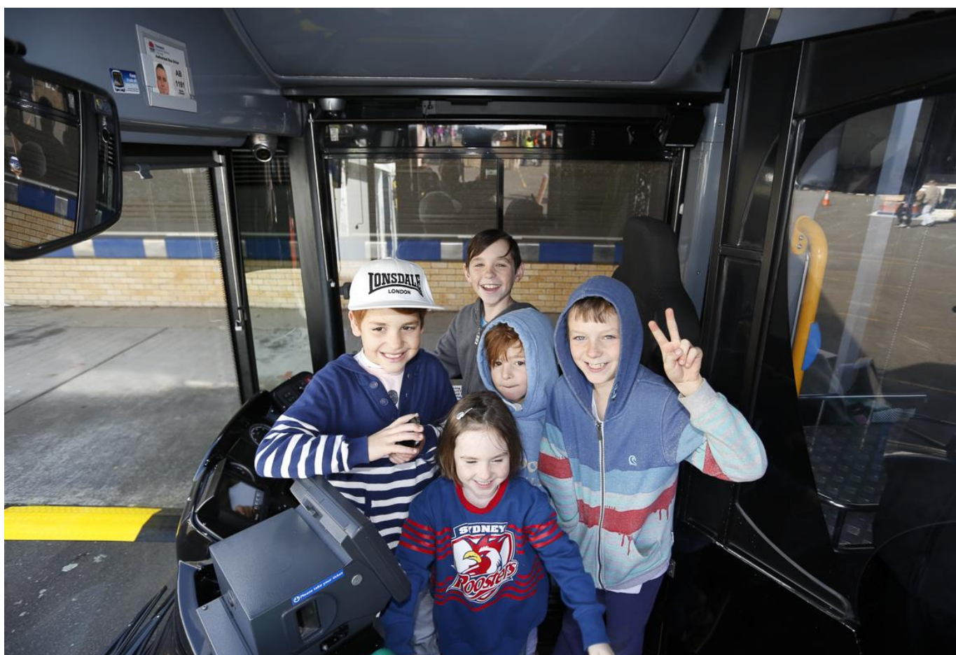
The Greater Sydney Talk Bus has proven to be a hit with young Sydneysiders.

A summary of current stakeholder engagement activities is provided in Table 1 overleaf.