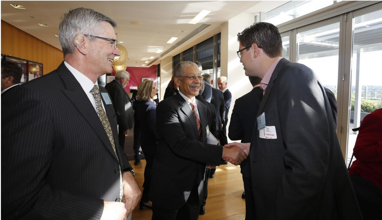
Commissioners meet with Mayors and Administrators of Greater Sydney Councils on 6 June 2016

The Commission has had a commitment from its commencement to listen and learn from people with a vast range of expertise and interests. We are engaging with community groups, Sydneysiders, businesses, State and Commonwealth agencies as well as local councils to understand what people want and need.