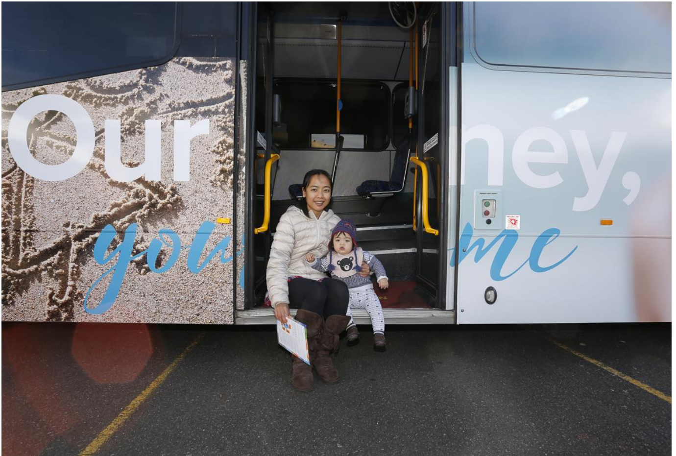
Our first Our Sydney, Your Home event, at the Canterbury Wholefoods Market in June 2016

Chapter Four outlines in detail the three stages of collaboration and engagement designed and implemented since the Commission's inception in January 2016 through to the exhibition of draft District Plans later in 2016.