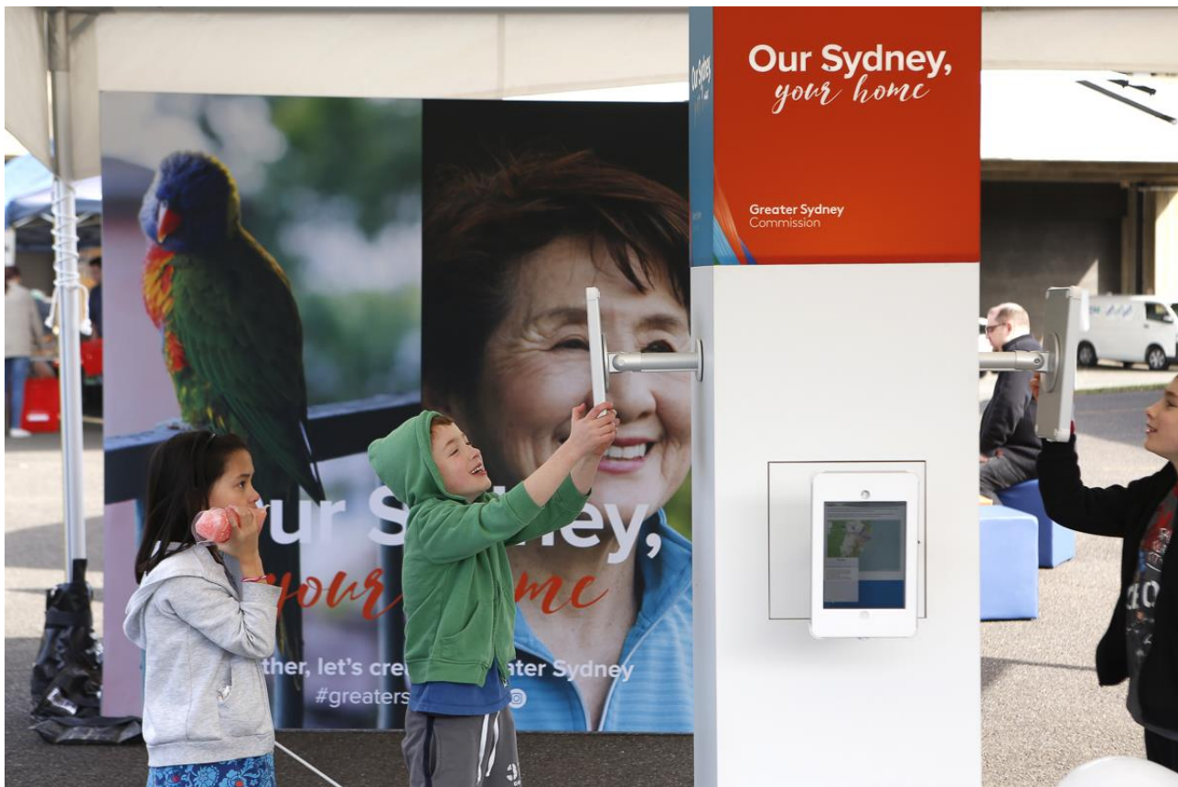
Young Sydneysiders giving feedback at a Talk Bus community engagement event in July 2016